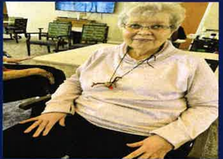
A few of our ladies who enjoy our Monday Morning Manicures. Manicures are offered every other Monday for both our assisted and independent living ladies.

"A little pampering goes along way, like a warm bath for the soul".